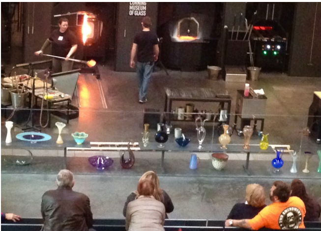
Children and their families watch a live glass-making demonstration at the Corning Museum of Glass, Corning, NY.

It was the program's creative, out-of-the-box initiative that supported the agency's mission, incorporated its values, while also enhancing the department that earned it The